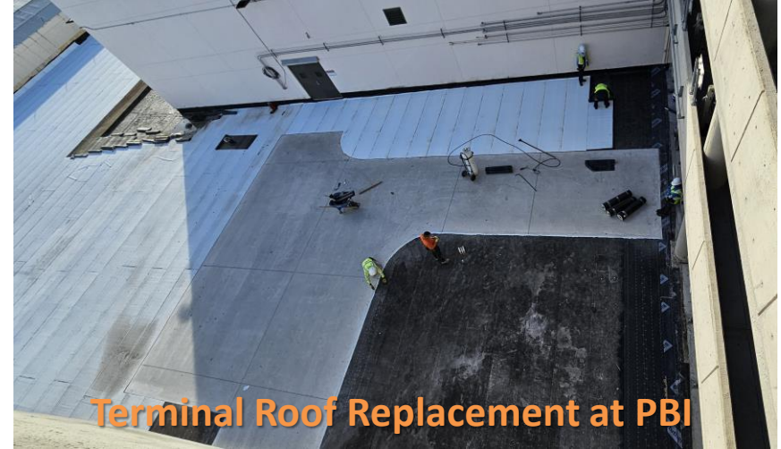
Terminal Roof Replacement at PBI