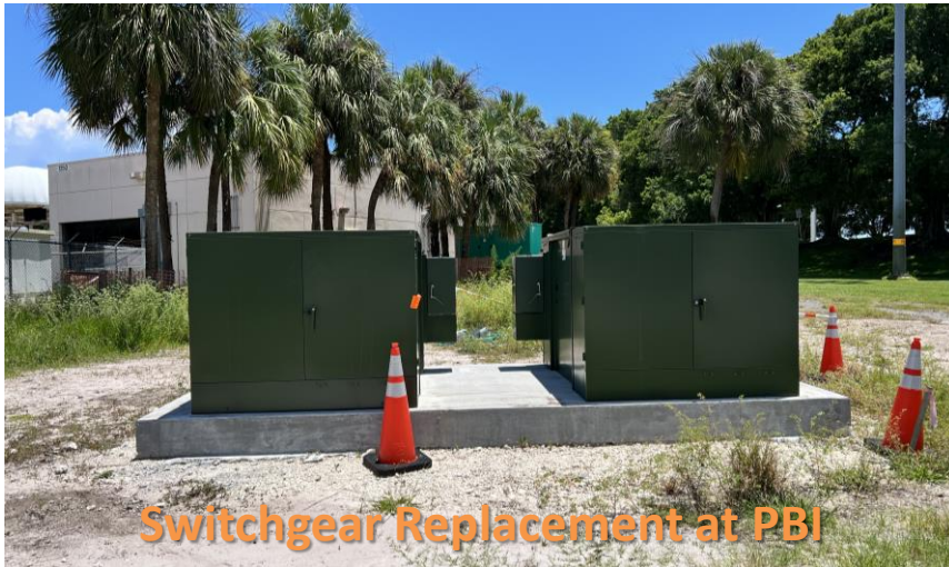
Switchgear Replacement at PBI