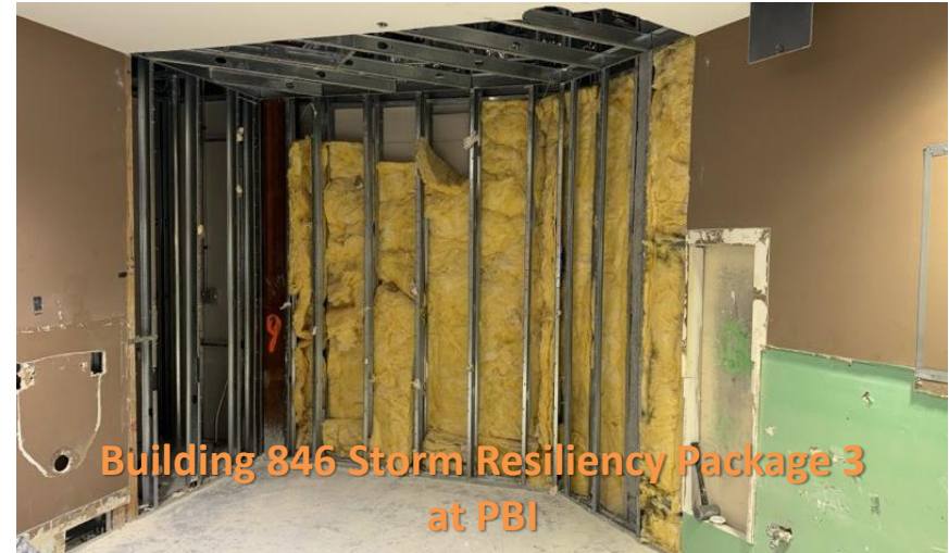
Building 846 Storm Resiliency Package 3 at PBI