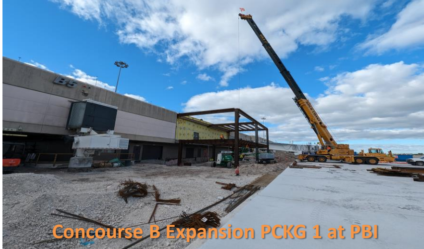
Concourse B Expansion PCKG 1 at PBI