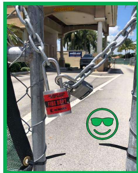
Photo 3 – this is the only way the Knox Lock should be used. Take your crews out and show them, hands on is the best way to learn. Both locks are “Links” in the chain!

Photo 2 - Later on Tuesday morning (same day) a different fire crew goes through the same gate and again locks the chain together bypassing the Contractors lock. We were again called to unlock the Knox lock.