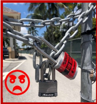
Photo 1 - On one particular Monday evening or early Tuesday morning fire crews went through the gate shown below. Upon placing the Knox Lock back on the chain it was done improperly. The fire crew locked the chain together and bypassed the Contractor lock. The contractor then had to call us to open the gate so that they could proceed to work.