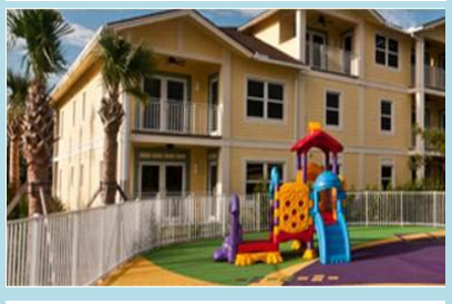
Davis Landings Apts. in Lake Worth

• With $7.5 million in NSP dollars, the County constructed its first homeless resource center, which has served more than 8,200 homeless persons since it opened in July 2012.