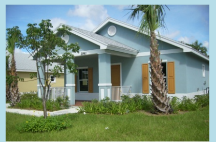
Single Family Home in Westgate