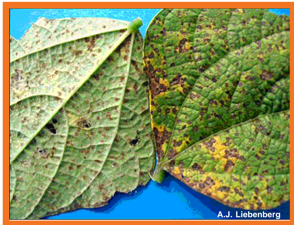
young lesions on infected dry beans