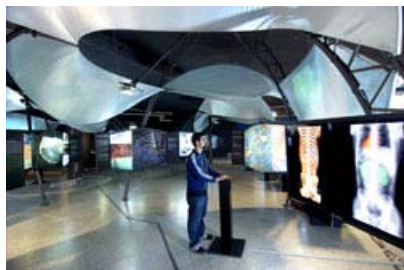
The Science Tunnel was first viewed in Ludwigshafen, Germany in 2005.