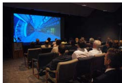
Guests at the press conference watch a video introducing the exhibit.

The Science Tunnel, a sophisticated, interactive multimedia show that offers visitors a fascinating trip into the realm of scientific discoveries, debuted in Ludwigshafen, Germany in 2005. It has traveled to Tokyo, Singapore, Shanghai, Brussels, Johannesburg,