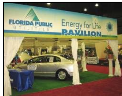
Energy for Life Pavilion at the WPB Home and Garden Fall Show highlighted green products and held mini-seminars