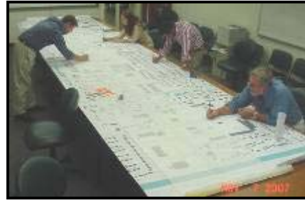
Photo above right: PBC Planning staff are in the process of putting the Military Trail corridor on paper at a scale of approx. 1" = 40' denoting all rights of way, existing buildings, water/drainage, easements, existing approvals and will later be adding in the TCRPC Plan/concepts.

A key recommendation from the TCRPC report is the "performance-based" Transportation Concurrence Exception Area (TCEA) that rewards projects that are consistent with the study. The URA Master Plan was approved 11/26/07 and there will be a BCC adoption hearing for the Master Plan and BCC initiation of Comprehensive Plan Amendment. Phase 4 is also underway with planning staff drafting and implementation of Form-Based Code for URA priority corridors and will continue through much of 2008. TCRPC continues to provide peer review and assistance.