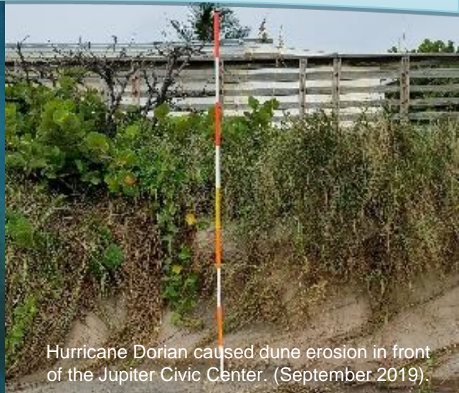
Hurricane Dorian caused dune erosion in front of the Jupiter Civic Center. (September 2019).