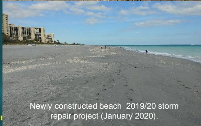
Newly constructed beach 2019/20 storm repair project (January 2020).