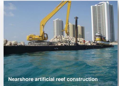
Nearshore artificial reef construction