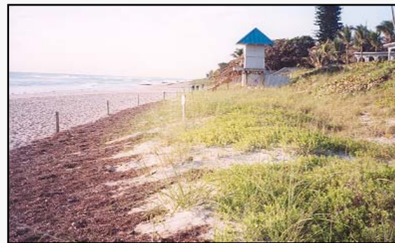
Seaweed is valuable to the dune system as a source of nutrients and a sand stabilizer.

Seaweed is beneficial to the beach and an important component of the ecosystem. The Department of Environmental Resources Management recommends that beach raking be limited to the more heavily used beaches. Beach raking too close to the dune can destroy new seedlings establishing at the leading edge of the dune. Although seedlings in this pioneer zone often become buried by wind-blown or storm-deposited sand, they usually grow through the new sand layer and continue to stabilize the area. Beach rake operators should stay well away from the toe of the dune. Seaweed removed from the beach can be deposited in a thin layer (2-3”) at the toe of the dune.