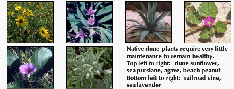
Native dune plants require very little maintenance to remain healthy. Top left to right: dune sunflower, sea purslane, agave, beach peanut Bottom left to right: railroad vine, sea lavender

Excessive watering of the dune usually results in the establishment of undesirable, invasive exotic plants. It is therefore important that all sprinklers near the dune be adjusted to avoid overspray onto the dune. New plantings may require temporary watering until the plants establish a well-developed root system.