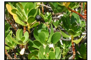
Endangered Native Inkberry Note black fruit and rounded leaves