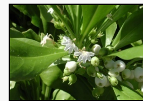
Exotic Hawaiian half-flower Note white fruit and long leaves

Invasive exotic plant species tend to overgrow native plant species and are less effective in maintaining the dune ecosystem.