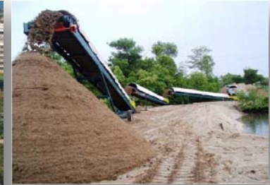
Electric conveyor system transporting sand