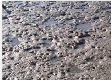
Muck sediments that were capped with sand