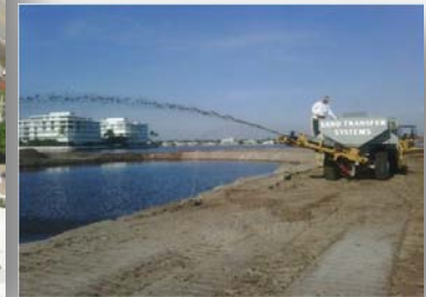
Sand shooter placing sand