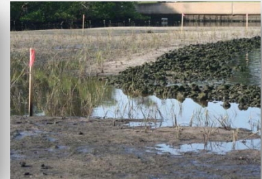
Habitat includes cordgrass, mangroves and oysters