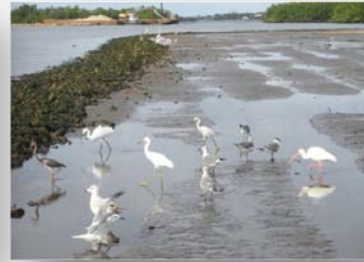
More wading birds and shorebirds utilizing the area