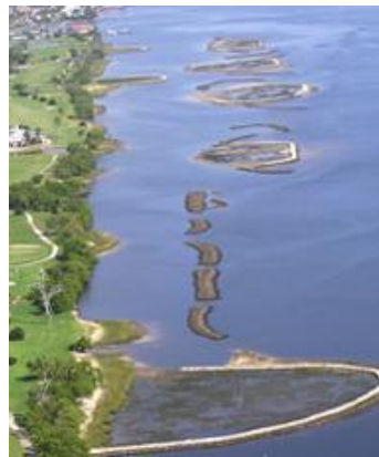
Snook Islands Natural Area

Recently, a contract for engineering services was approved to conduct standard penetration tests at the site to determine how deep into the Lagoon bottom to drive piles for the structures. Design and engineering of the structures is ongoing. Project partners include Palm Beach County, City of Lake Worth, Florida Inland Navigation District and the Metropolitan Planning Organization.