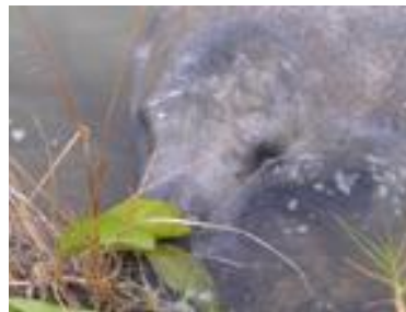
A manatee enjoys lunch at Peanut Island.

The Intracoastal Waterway (ICW) and the Lake Worth Lagoon are the manatee's version of I-95. Just as local motorists need to share the road with vacationers, local and visiting boaters need to share these waterways with manatees as they travel. The Palm Beach County Department of Environmental Resources Management takes action year-round to help protect manatees. Efforts include a brochure with manatee speed zone maps, educational kiosks at boat ramps, habitat restoration and enhancement projects, and a new Law Enforcement Program. The program involves coordination with 10 law enforcement agencies and aims to increase compliance with manatee speed zones countywide.