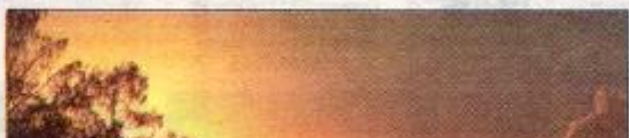
'Let's Roll,' above, by Cookie Schwartz, right, is a 24-by-24-inch photograph