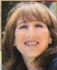
'Dreamscapes: Beach Series X,' above, by Cheryl Maeder, left, is a 30-by-45-inch archival-print-on-canvas and $2,500.