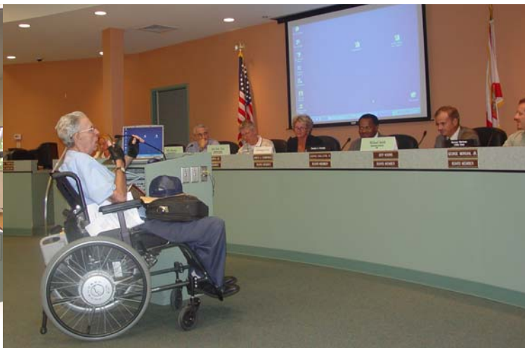
RCAC Members listen to presentations and comments from committee members and interested public.