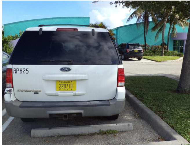
City Vehicle RP825 parked in front of the Parks and Recreation Department [photo taken on August 29, 2014]