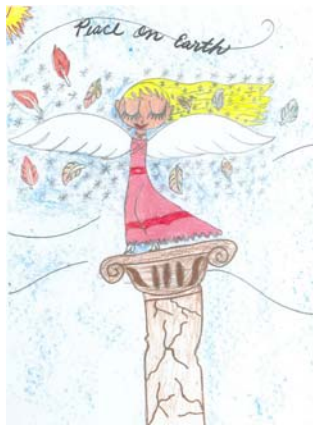
Kyle Morales 2007 1st Place Winner: