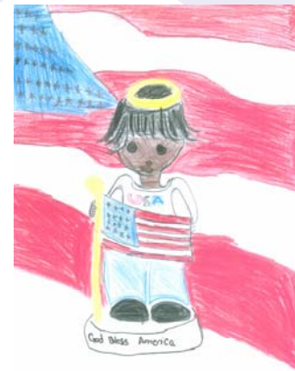
Justyn Eastling 2008 1st Place Winner: