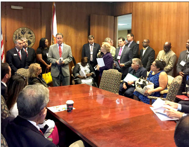
Meetings with legislators are a valuable part of PBC Day.