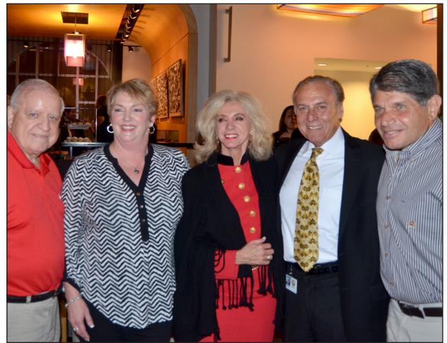
Senator Maria Sachs poses with PBC Day attendees.