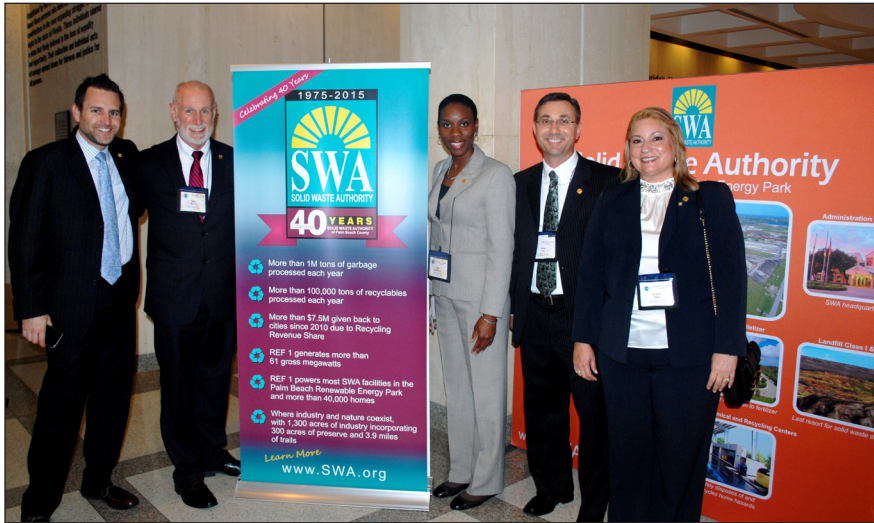
Solid Waste Authority putting the final touches on their PBC Day exhibit.

For many years at Palm Beach County Day, organizations have had the opportunity to create an exhibit in the Capitol Rotunda that promotes their organization. This is a great opportunity to get your organization's message out to the many Palm Beach County Day participants who are visiting Tallahassee. Many of these attendees to the various PBC Day events are the "movers and shakers" of the county, and most likely, decision makers. This is an ideal audience for any organization hoping to make an impact on the county as well as the lawmakers in Tallahassee. One eight foot table and two chairs are provided by Palm Beach County Public Affairs to any attendee who would like to have an exhibit in the Rotunda. The space is reserved, but call now to make sure you have a spot. Please contact PBC Public Affairs at (561) 355-4125 or e-mail castephe@pbcgov.org .