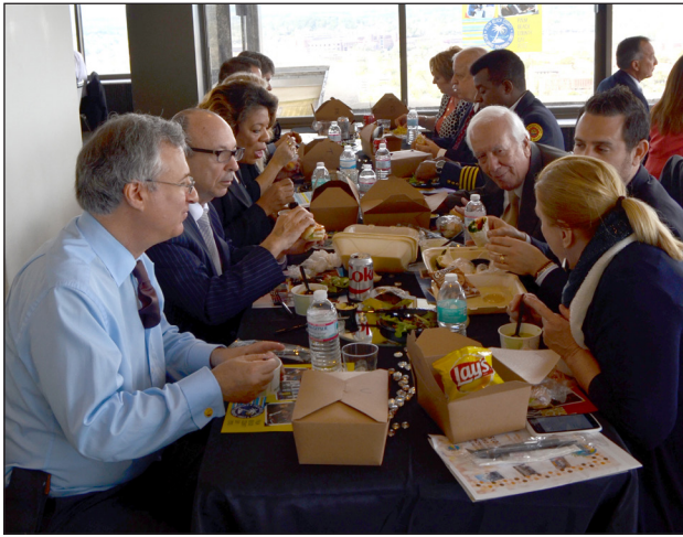
Networking over lunch on the 22nd Floor.