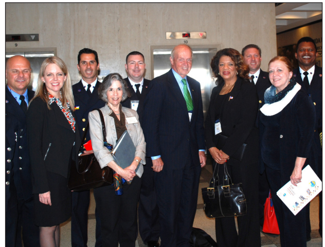
Commissioners and Firefighters begin their day in the Capitol.