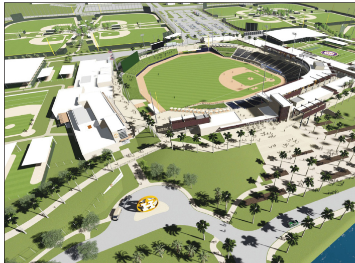
Rendering of the new spring training site in Palm Beach County