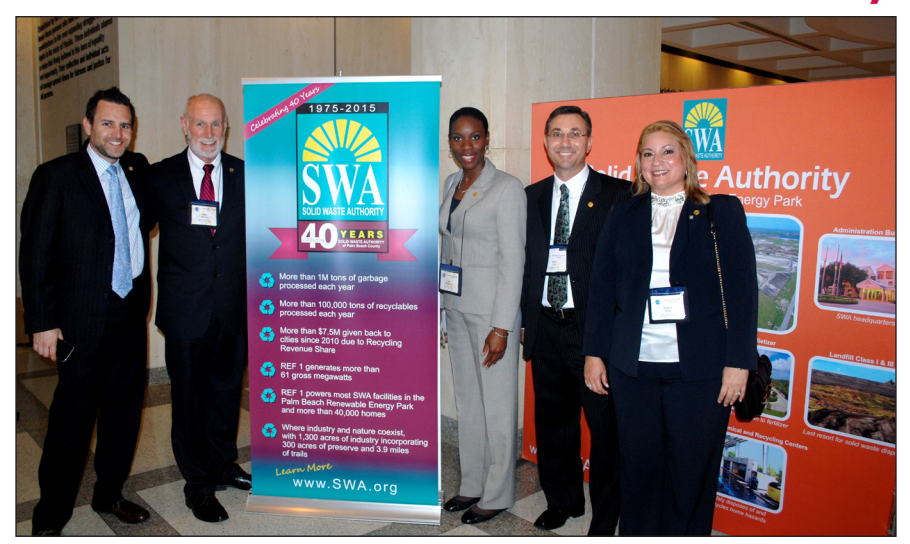
Solid Waste Authority putting the final touches on their PBC Day exhibit.

For many years at Palm Beach County Day, organizations have had the opportunity to create an exhibit in the Capitol Rotunda that promotes their organization. This is a great opportunity to get your organization's message out to the many Palm Beach County Day participants who are