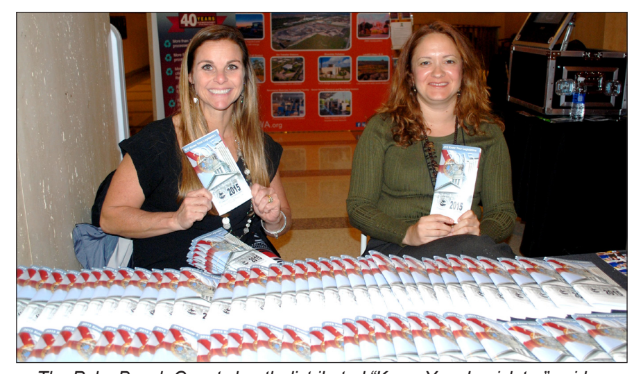
The Palm Beach County booth distributed "Know Your Legislator" guides.

Affairs at (561) 355-4125 or e-mail <a href="mailto:castephe@pbcgov.org">castephe@pbcgov.org</a>.