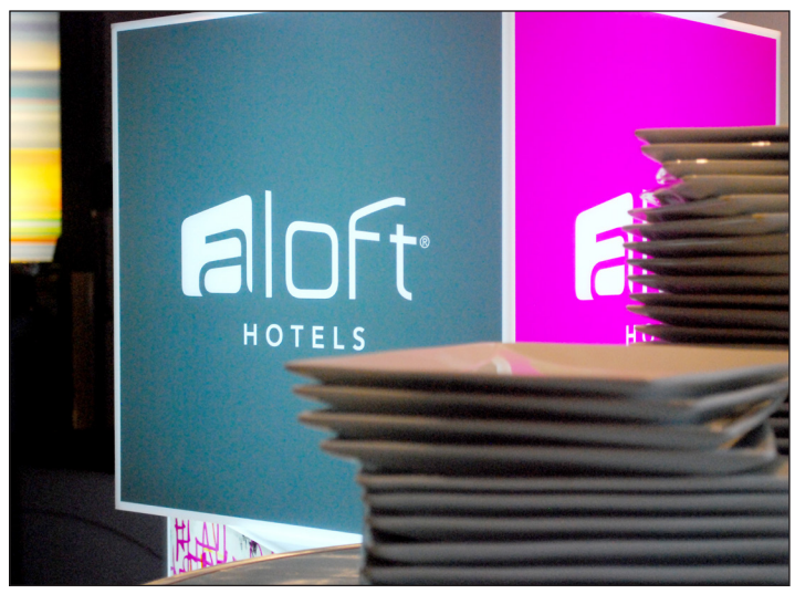
PBC Day 2015 Breakfast at the Aloft