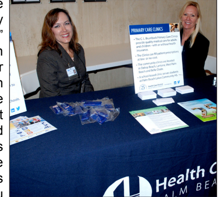
The Health Care District exhibit

visiting Tallahassee. Many of these attendees to the various PBC Day events are the "movers and shakers" of the county, and most likely, decision makers. This is an ideal audience for any organization hoping to make an impact on the county as well as the lawmakers in Tallahassee. One eight foot table and two chairs are provided by Palm Beach County Public Affairs to any attendee who would like to have an exhibit in the Rotunda. The space is reserved, but call now to make sure you have a spot. Please contact PBC Public