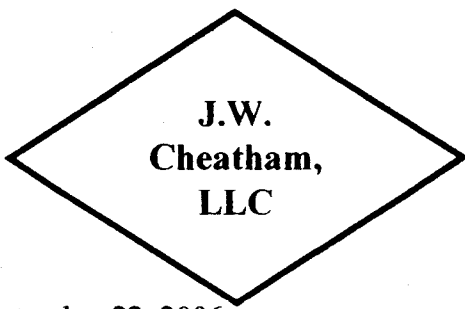
EXHIBIT "A" ROAD BUILDING & EARTHMOVING CONTRACTORS