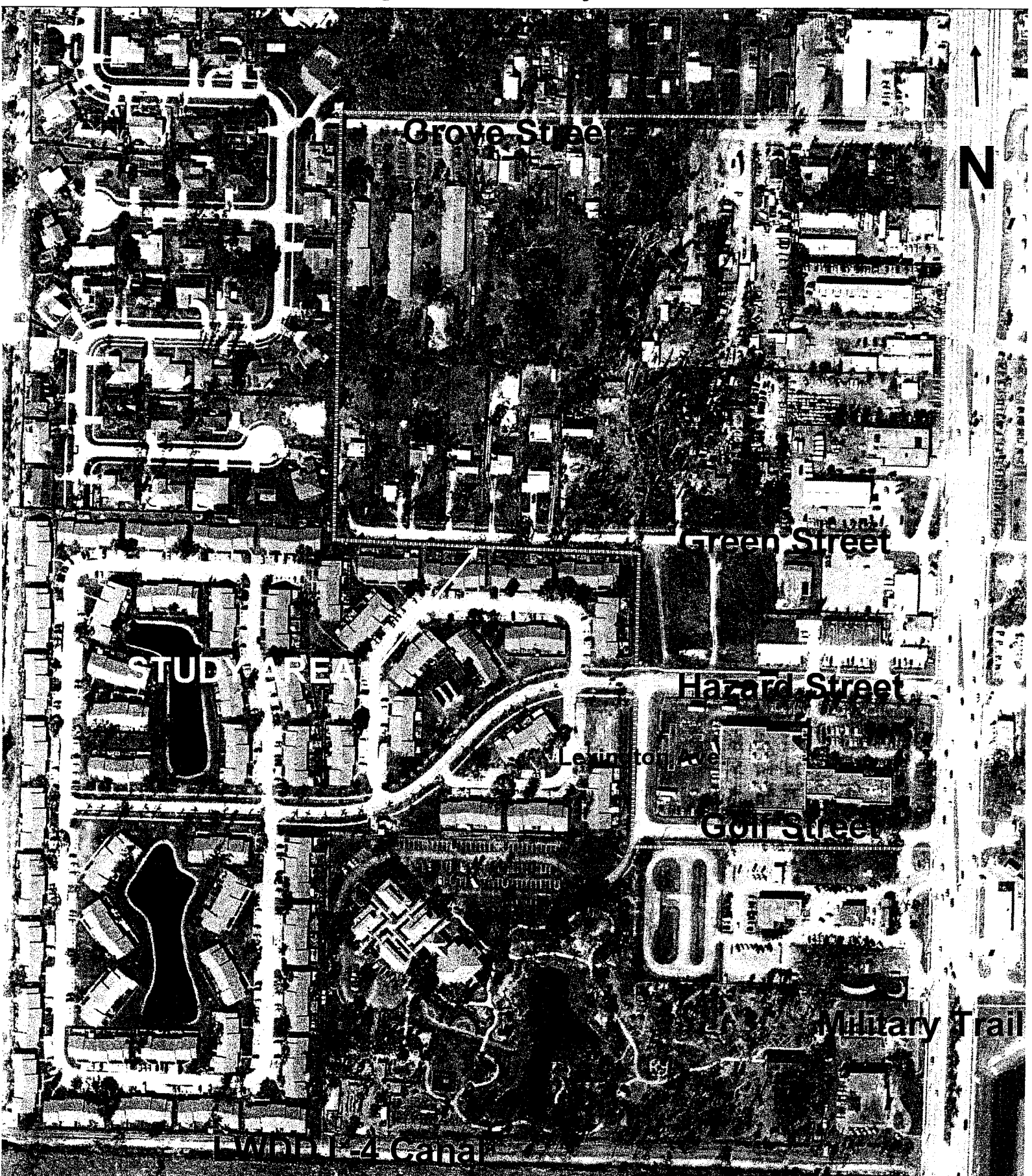
Figure 1 - Study Area