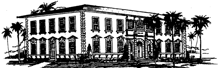
LAKE PARK TOWN HALL