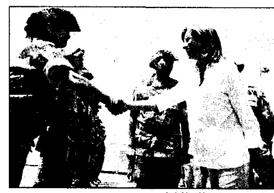
Defense Minister Carme Chacon shakes hands Saturday with a Spanish soldier on a peacekeeping mission in northwest Afghanistan.

Al-Qaeda in Iraq tape calls for offensive CAIRO — A man claiming to be the leader of Al-Qaeda in Iraq vowed in an audiotape released Saturday to launch a monthlong offensive against U.S. troops. There was no independent confirmation that the voice belonged to Abu Hamza al-Muhajir, also known as Abu Ayyub al-Masri, but it sounded exactly like the one heard on previous audiotapes. Al-Muhajir has been the leader of Al-Qaeda in Iraq since his predecessor Abu Musab al-Zarqawi was killed in a U.S. airstrike northeast of Baghdad in 2006.