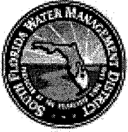
EXHIBIT "C1" FY 2010 SOUTH FLORIDA WATER MANAGEMENT DISTRICT WATER SAVINGS INCENTIVE PROGRAM COOPERATIVE FUNDING QUARTERLY PROGRESS REPORT FORM