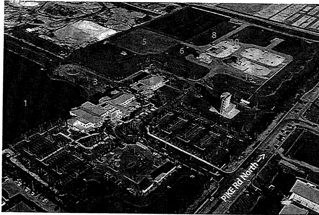
PBCFR Regional Training Center