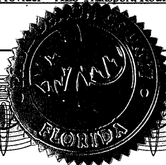
Chair, Board of County Commissioners