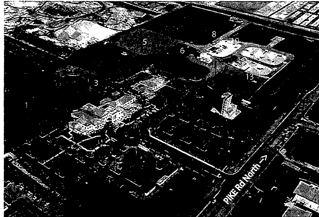
PBCFR Regional Training Center