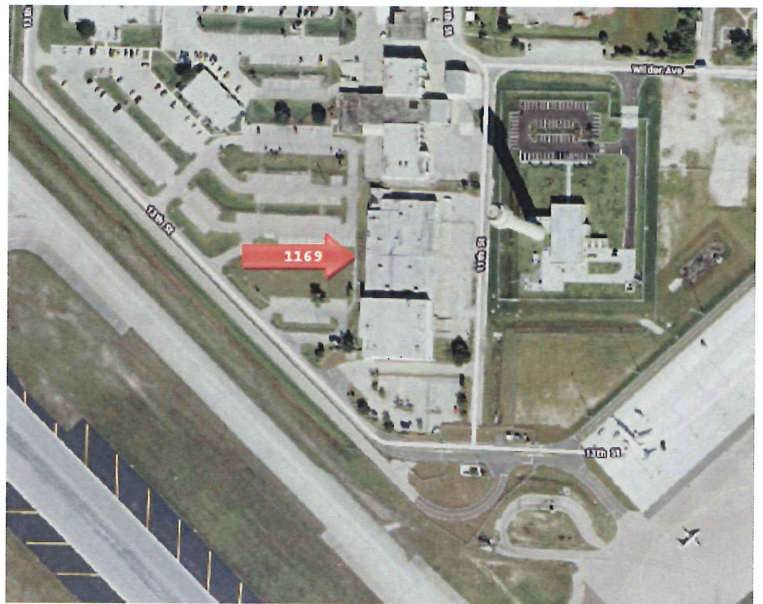
PBI Building 1169 – Non-Aviation Building