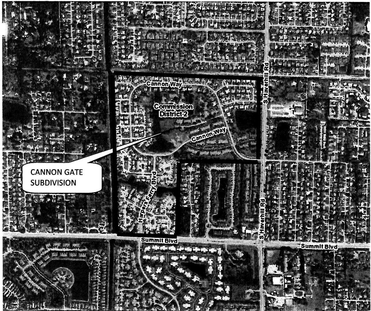
(Cannon Gate Subdivision)