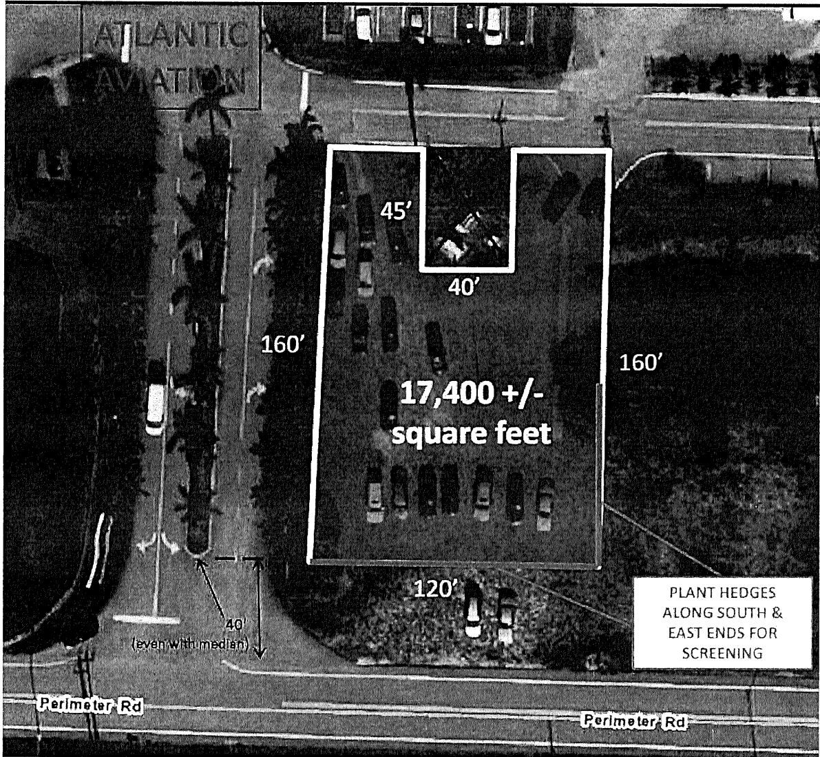
EXHIBIT "A" THE PROPERTY