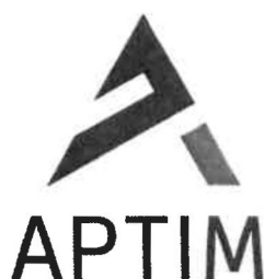
Exhibit C page 1 of 24

APTIM 6401 Congress Avenue, Ste. 140 Boca Raton, FL 33487 Tel: +1 561 391 8102 Fax: +1 561 391 9116