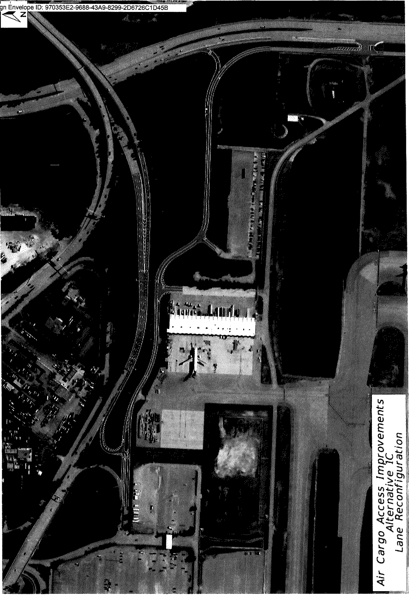
Air Cargo Access Improvements Alternative 1C Lane Reconfiguration