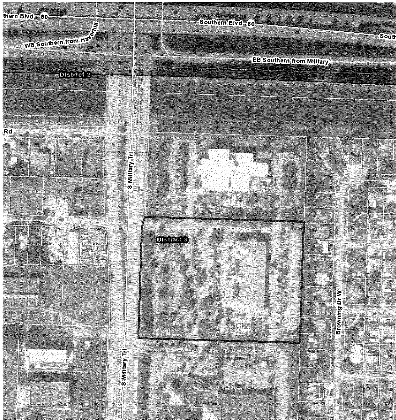
50 S. Military Trail, West Palm Beach, FL 33415