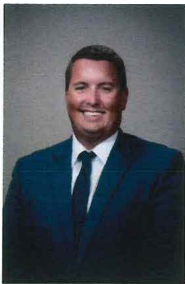
Cameron May Commissioner (10/1/24 to 3/18/25)