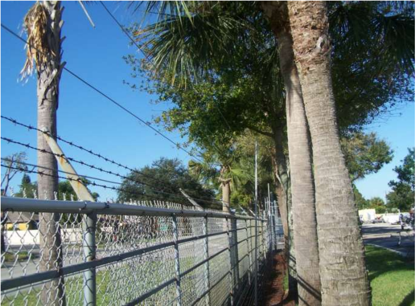
Photo 3 Marine Connection south property line looking west