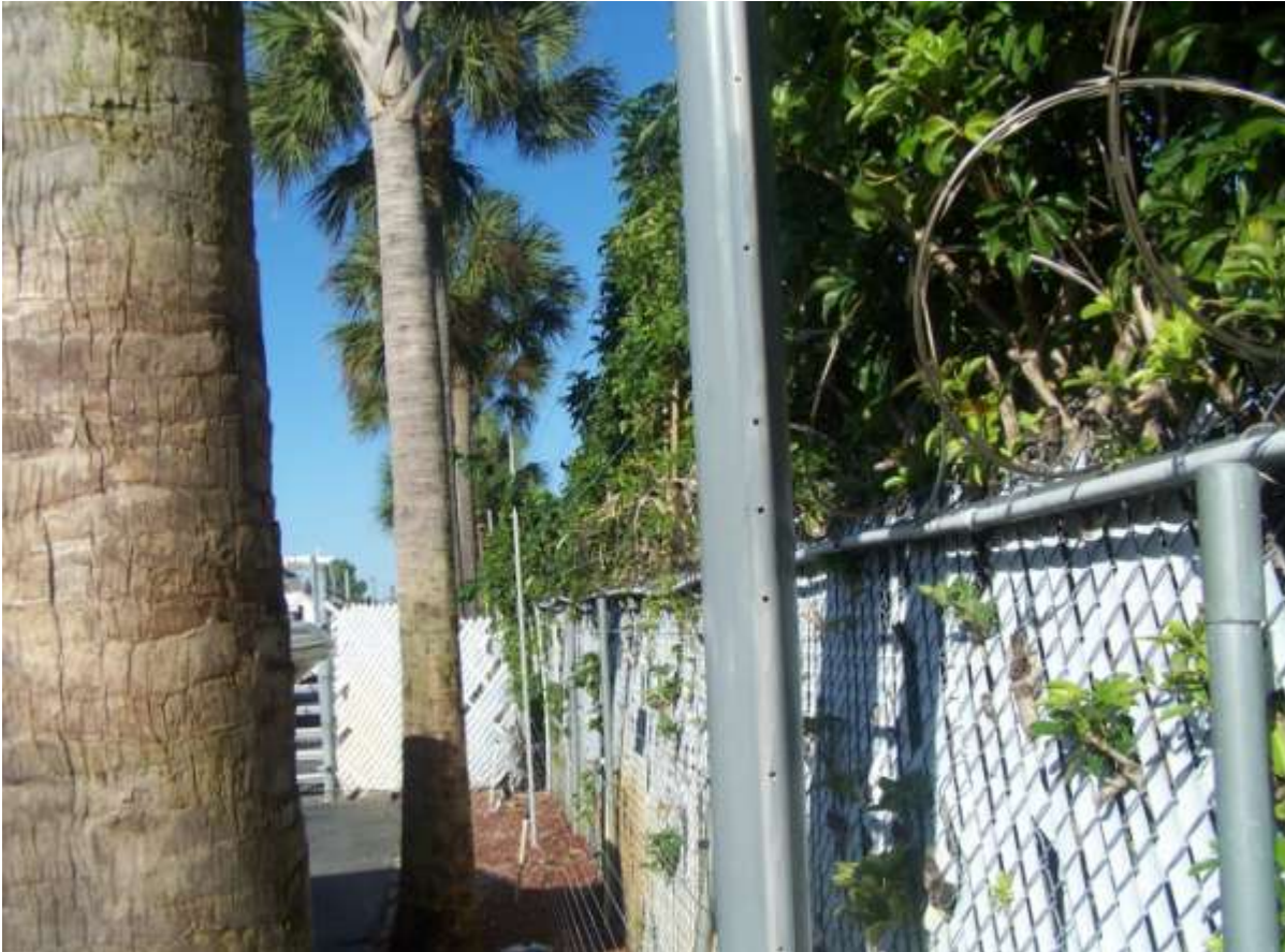
Photo 1 Marine Connection north property line looking west

WEST: FLU Designation: Residential High 8 (HR8) and Residential Medium 5 (RM) Zoning District: Residential Medium Supporting: Multifamily Residential (Georgia Pines, Control No 2005-369)