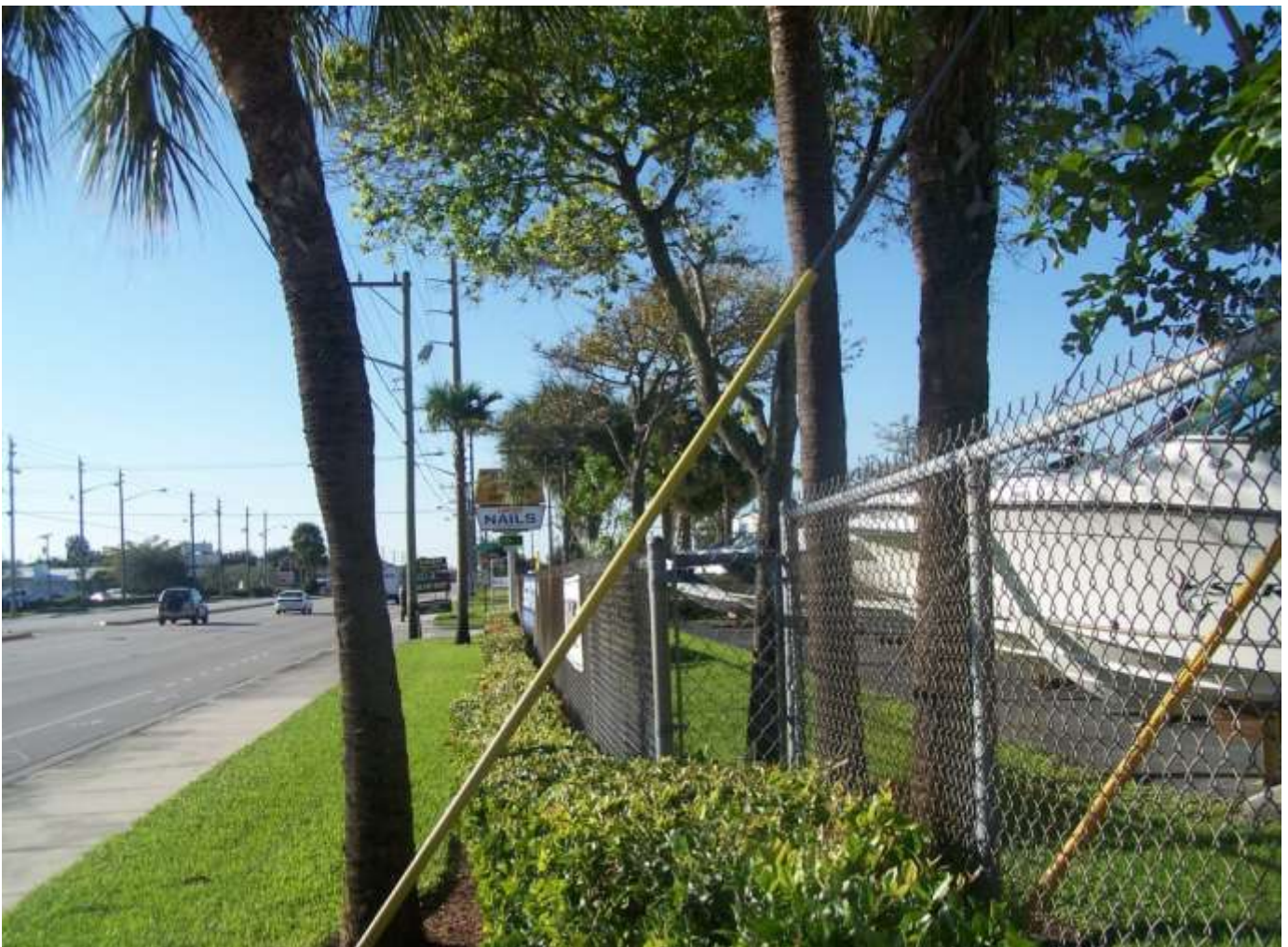
Photo 4 Marine Connection east property line looking south